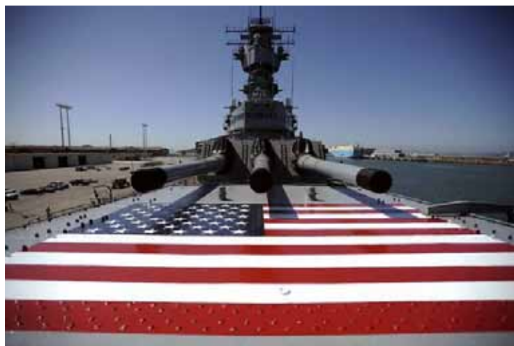
USS Iowa still lives.