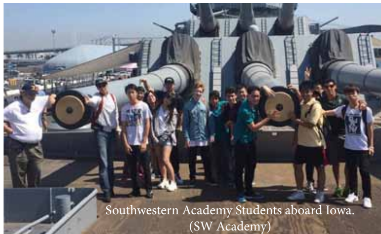
Southwestern Academy Students aboard Iowa.

She’s the battleship USS Iowa, still bristling with firepower after being decommissioned and harbored as a floating museum in the Port of Los Angeles’ Berth 87 since July 4, 2012.