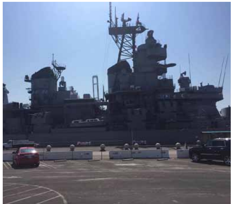
USS Iowa in San Pedro