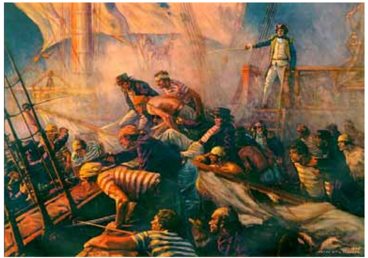
Jones leads his crew.

The fire from the tops of the Bonhomme Richard was conducted with so much skill and effect as to destroy ultimately every man who appeared upon the quarterdeck of the Serapis, and induced her commander to order the survivors to go below. Nor even under shelter of the decks were they more secure. The powder-