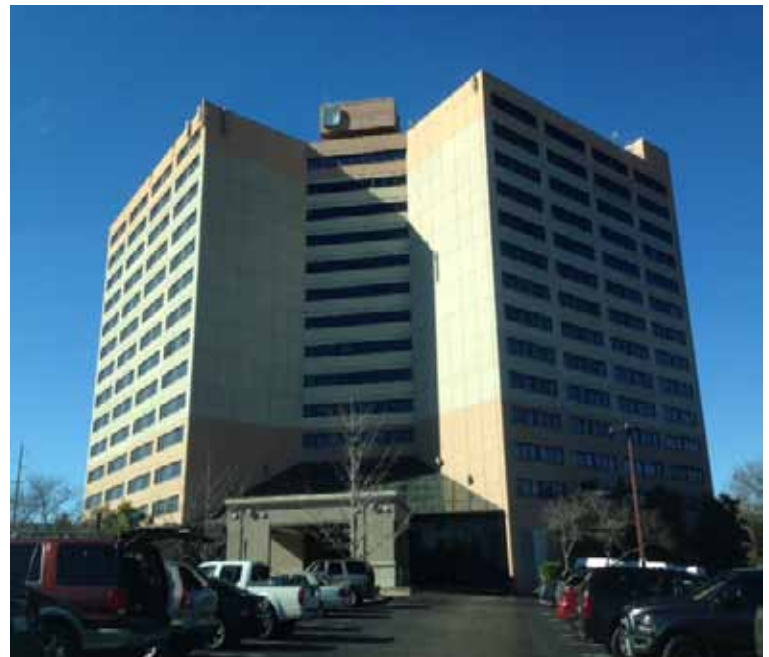
Hilton Nashville Airport Hotel