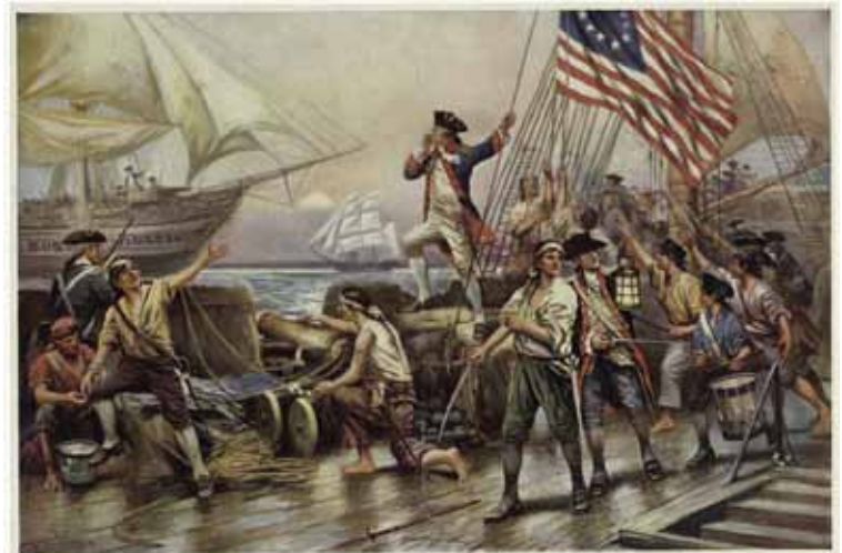
“I have Not yet begun to fight.”

As we were unable to bring a single gun to bear upon the Serapis , our topsails were backed, while those of the Serapis being filled, the ships separated. The Serapis bore short round upon her heel, and her jib boom ran into the mizen rigging of the Bonhomme Richard . In this situation the ships were made fast together with a hawser, the