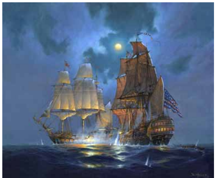
Bonhomme Richard and Serapis

monkeys of the Serapis, finding no officer to receive the eighteen-pound cartridges brought from the magazines, threw them on the main deck, and went for more. These cartridges being scattered along the deck, and numbers of them broken, it so happened that some of the hand grenades thrown from the main-yard of the Bonhomme Richard, which was directly over the main hatch of the Serapis, fell upon this powder, and produced a most awful explosion. The effect was tremendous. More than twenty of the enemy were blown to pieces, and many stood with only the collars of their shirts upon their bodies. In less than an hour afterward the flag of England, which had been nailed to the mast of the Serapis, was struck by Captain Pearson's own hands, as none of his people would venture aloft on this duty; and this, too, when more than 1,500 persons were witnessing the conflict, and the humiliating termination of it, from Scarborough and Flamborough Head."