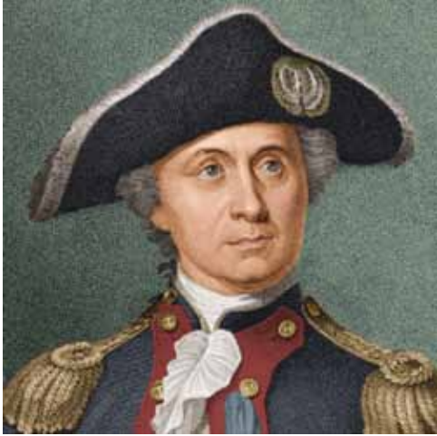
John Paul Jones

“I have not yet begun to fight!” This was the immortal retort of Captain John Paul Jones to a request to surrender as he and his crew engaged in a desperate battle with a British frigate off the northern coast of England during the American Revolution.